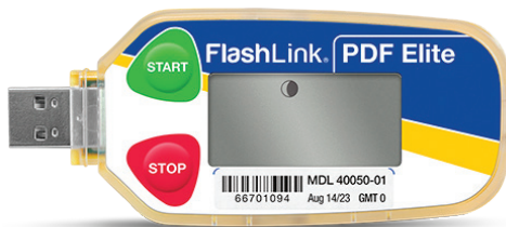
LCD with Shadow Log® icon