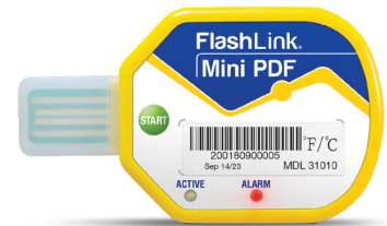
Red LED flashing