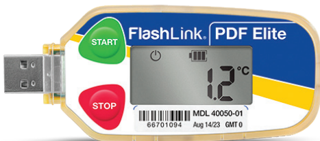
LCD in normal logging mode

Models without LCD: No LED lights flashing indicates logger is in Shadow Log® mode