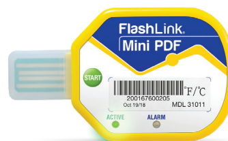
Green LED flashing

Models without LCD: No LED lights flashing indicates logger is in Shadow Log® mode